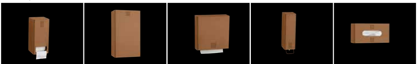
double toilet roll-holder KU-300 waste bin KU-200 paper towel dispenser KU-100 soap dispenser KU-140-LO cloth towel dispenser KU-190